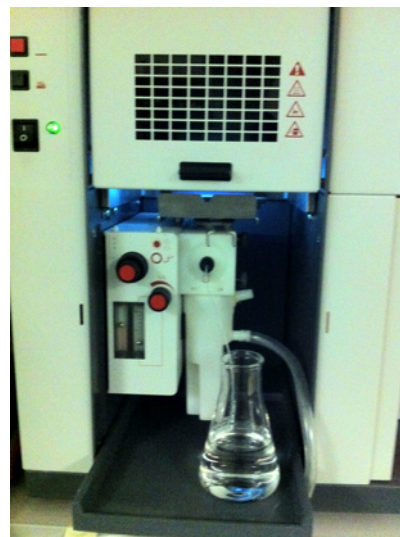
Figure 6. Detail of the sample area. The Erlenmeyer flask is the distilled water reservoir. While the flame is burning water must flow continuously into the nebulizer and the drain tube must be unobstructed.

the volume with water. This is named the “undiluted unknown sample solution.” Solutions with high turbidity require filtration to remove the particles that will clog the spectrometer inlet. Use a simple gravity filter made up of either a single folded piece of filter paper or a small ( \sim 2 \text{ cm}^2 ) piece of filter loosely balled up in the top of the stem of a funnel to filter a small quantity of the undiluted unknown sample solution ( \sim 10 \text{ mL} ). Dilute this filtered solution by a factor of one hundred (100) to obtain a “diluted unknown sample solution.” (Compute the approximate [\text{Ca}^{2+}] of both the undiluted and diluted unknown sample solutions.)