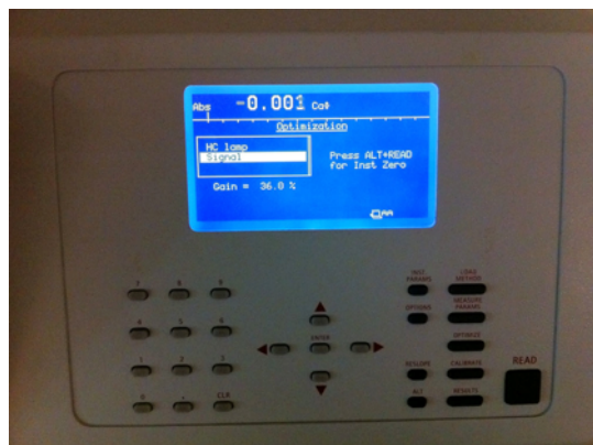
Figure 5. Display, control and readout section showing the Signal screen. The spectrometer has not yet been zeroed and displays a non-zero absorbance.

volume of 1 M hydrochloric acid required to completely react with the manufacturer's reported amount of calcium carbonate in the tablet. Slowly and carefully add 110% of this volume of acid to the beaker. Considerable foaming will occur from the carbon dioxide evolution. The solution may be turbid or contain bits of residual tablet coating at this point. Bring the suspension just to a boil using a hot plate set to 200 °C to remove any remaining traces of carbon dioxide. Cool then quantitatively transfer the beaker's contents to a 250 mL volumetric flask and make up