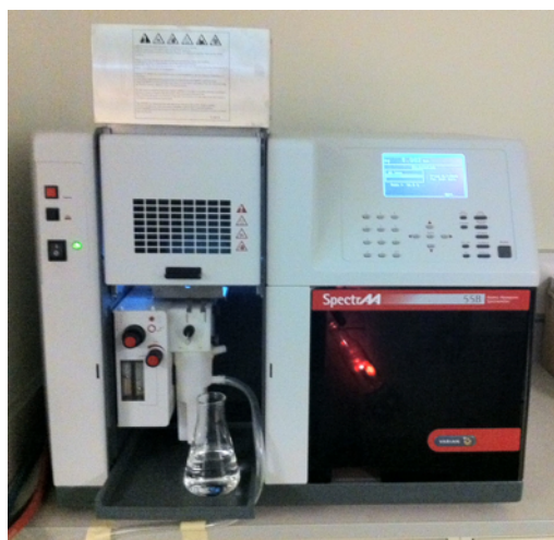
Figure 2. The Varian SpectrAA 55B atomic absorption spectrometer. The user interface and display are located at the upper right, the light source at the lower left, the sample nebulizer, aspirator and reservoir at the lower left, the burner at the upper left and the exhaust chimney at the extreme upper left.