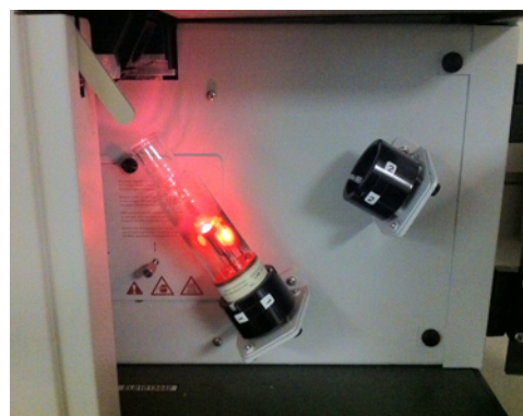
Figure 4. A hollow cathode lamp serving as a light source for absorption measurements installed in lamp position #1. Another lamp can be installed in position #2 to facilitate rapid switching between different elements.