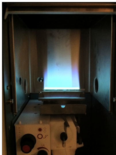
Figure 3. The burner section with the cover removed and showing acetylene-air flame.

The light source used in atomic absorption spectroscopy deserves special mention. As previously mentioned, the width (in the wavelength dimension) of an atomic absorption is exceedingly narrow. In order for Beer's law to hold it is necessary for an analyte to absorb all of the light that falls upon the light detector. In other words, the width of the absorbance must be wider than the detector's width, which is almost always determined by the quality of the monochromator. It is almost impossible to achieve monochromator bandwidths in the range of 0.01 nm and narrower. Even if it were possible the amount of light reaching the detector would be infinitesimally small, resulting in very poor quality measurements. The solution to this problem is to use a light source that is based on the very element that is being analyzed. The so-called hollow cathode lamp is constructed of a metal cathode composed of the metal element to be analyzed and contained in a transparent tube filled with an inert gas, for example, neon or argon. A high voltage electrical discharge ionizes the filling gas and the ensuing plasma is effective in mobilizing metal atoms from the cathode which are then excited by the plasma and glow very brightly and with a band width as narrow as the absorbing atoms in the analyte thereby relieving the narrow bandwidth requirement of the monochromator.