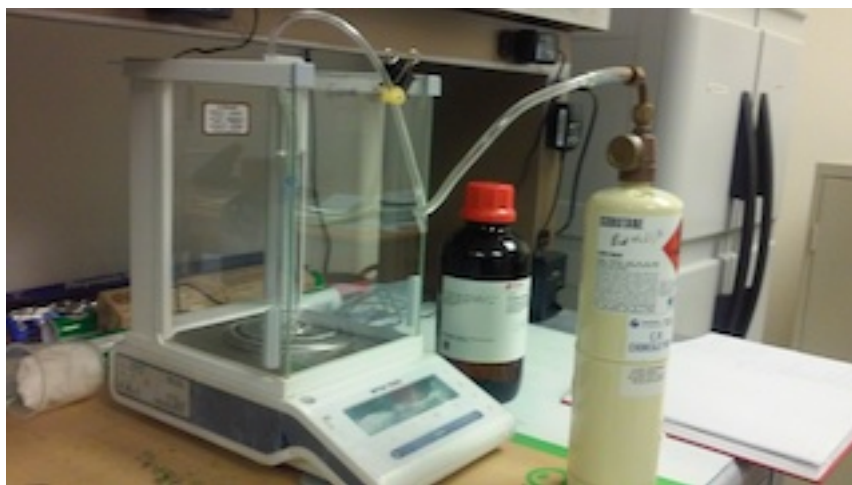
Figure 1. Apparatus for dissolving propane, n-butane and iso-butane in DMSO.

The appropriate gas is passed through the DMSO at a rate of about 1 bubble per second. This is continued for roughly twenty minutes.